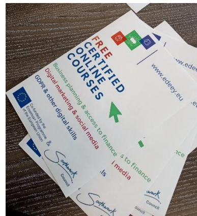
The Final Conference at the IARS's venues in London

The EDEEY project it's near to its end and we are very happy that all the outputs have been delivered successfully! The final output IO3 – Face to face workshops is done in each partner country with success and the partners are now finalising the Multiplier events! The Final Conference was the highlight of the project which took place on the 22 nd of June!