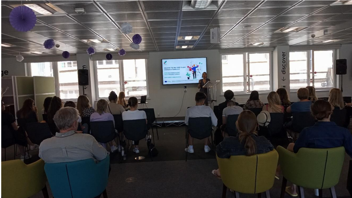
The Final Conference at the IARS's venues in London

independently proves that businesses or organisations puts profits towards social or environmental good rather than creating shareholder value.